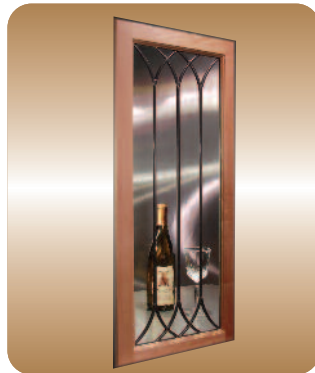
DB-7 - Gothic Design (shown)