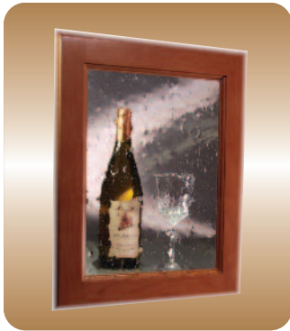
#11 Crystal Seedy (shown)